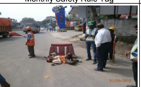
Mock Drill Conducted On Road Accident at Pachaiyappas College Station