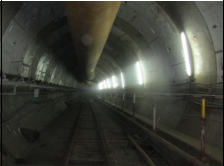
Good housekeeping and emergency lighting ensured in tunnels.