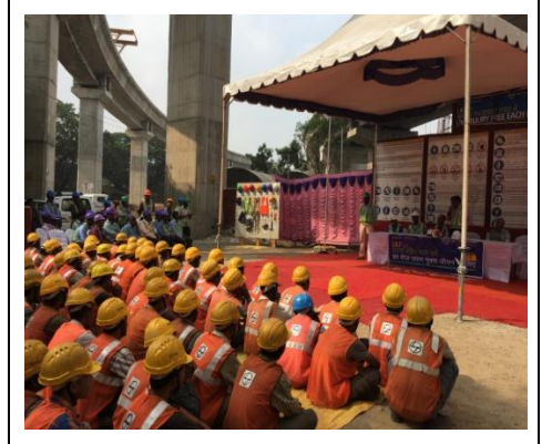
L&T Safety month celebrations 2015.