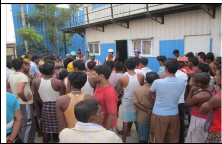
Mock Drill conducted at Labour Colony