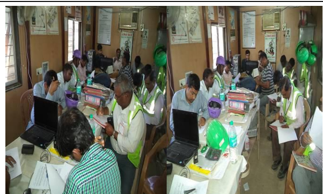
OHS&E Quiz Competition