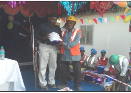
Safety Conscious Person Award - prize & certificate distribution by Chief Engineer (S&H) deputy, ER.