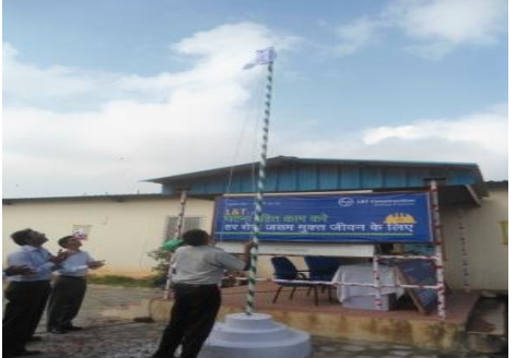
Safety Flag Hoisting by RE, ER.