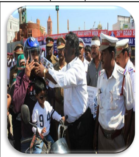
Distribution of Helmets on eve of Road safety week.