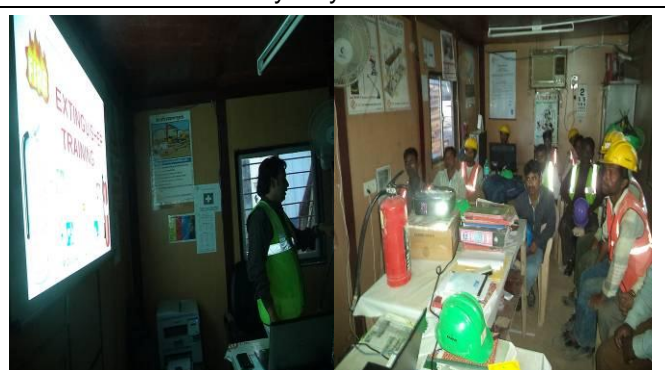
Fire Training To Workmen