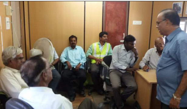
Safety Training to OHE Team – Job/Task Safety Analysis by CSM