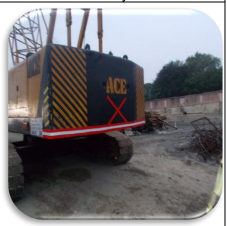
For clear visibility of Equipments in night times reflective tape was sticked