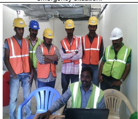
Height work video trainings are conducted to workers and staff to educate the hazards and control measures for safe working.