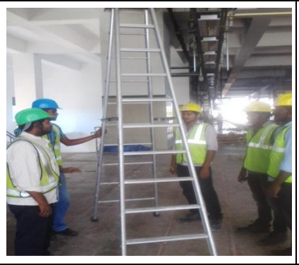
Ladder Safety trainings are conducted to workers on regular