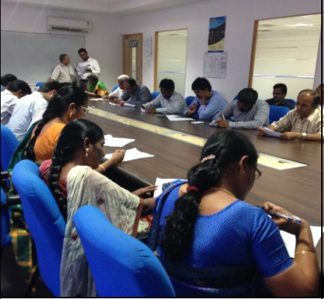
Participants of Safety Quiz competitions