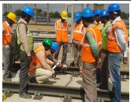
Job specific (Stud welding) Trainings are conducted to all workers and Technicians on regular basis.