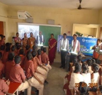
As part of CSR Activity, a Training on Home, School and Road Safety to LBEAAR School Children by EHS Team