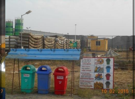
Provision of cage for waste bins.