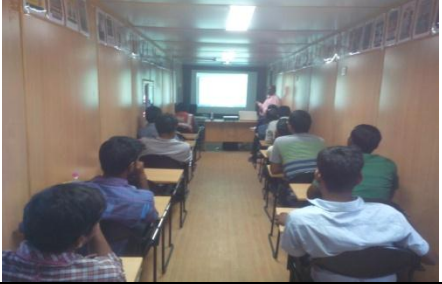
Permit to Work System Training to all management staff by EHS Solutions