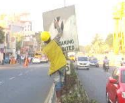
Regular cleaning of sign boards are carried out by Gammon-MMS JV.