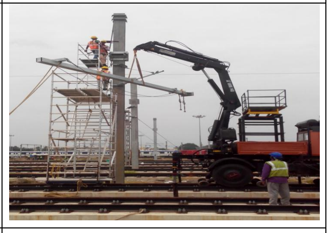
Two track cantilever erection using Unimog and trolley