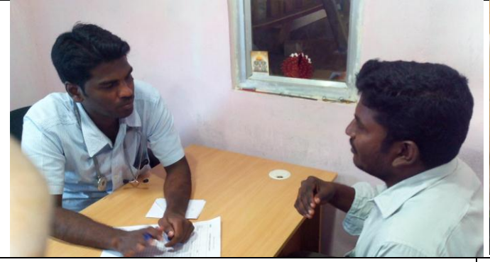
Medical camp at Koyambedu Site