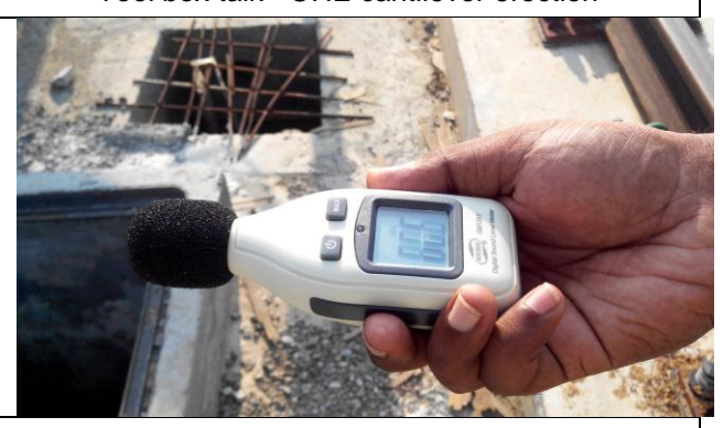
Noise Monitoring at Koyambedu Depot