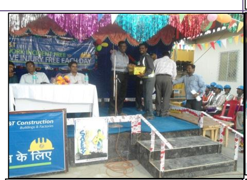
Online ATL (Any Time Learning) Safety course completion certificate & prize distribution to Site Engineer.