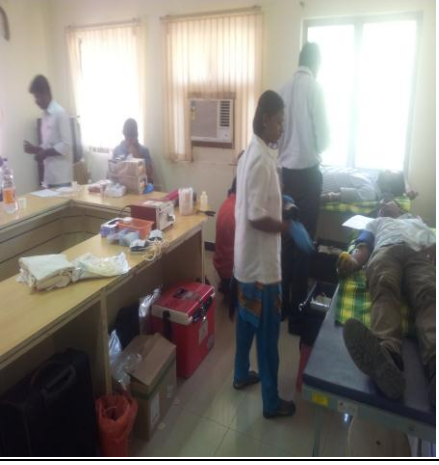
Blood Donation camp Organised at Voltas office as part of our CSR Activity