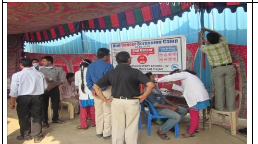
Oral Cancer Awareness Camp conducted in Labour Colony for all workers to bring awareness about oral hygiene.