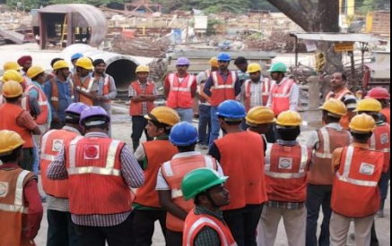
MS/RA briefing to staff/workers before commencement of work.