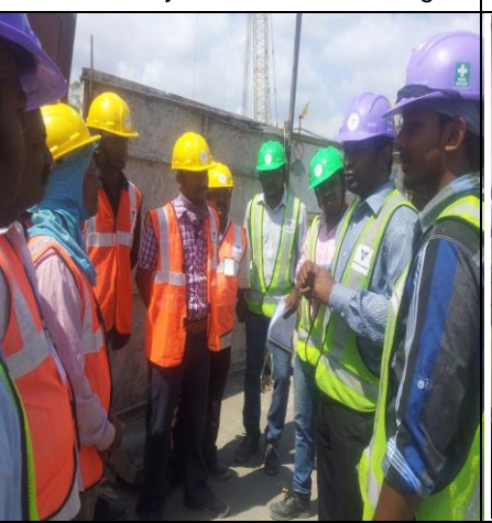
Health Awareness on" skin cancer & silicosis" conducted at Nehru park station by Occupational Health Officer