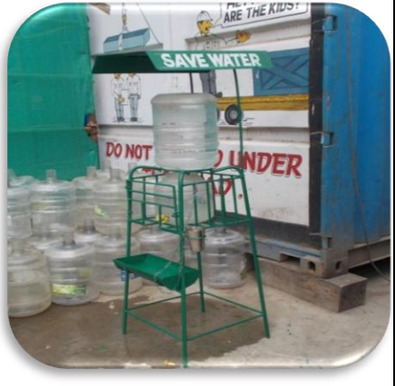
Arrangement of Drinking water facility in the sites.