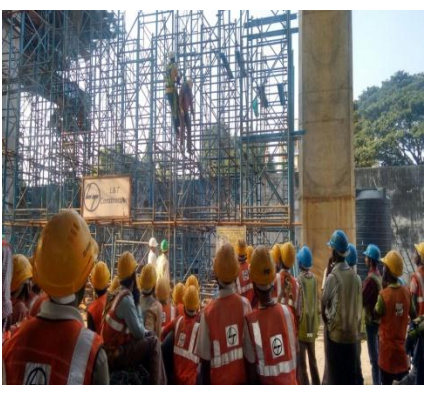
Third party Height Work training and emergency rescue demonstration conducted at Guindy.