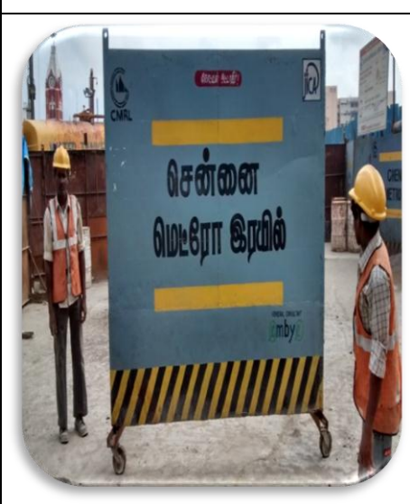
Moving wheels got attached for easy movement of hoarding boards.

"SAFETY ISN'T JUST A SLOGAN, IT'S A WAY OF LIFE"