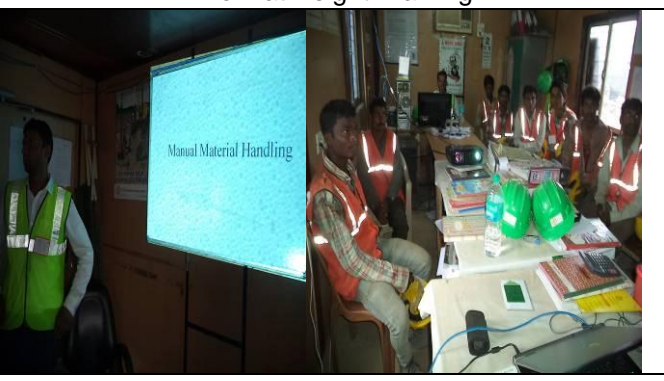
Manual Material Handling Training