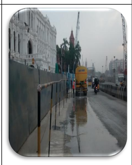
Sprinkling of water in and outside the site premises to control dust.