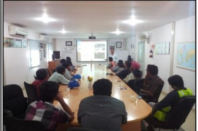
Permit To Work Training For All Engineers and Supervisors