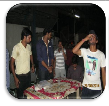
Malarial & Dengue medical camp conducted in labour camp and distributed anti malarial tablets to all workers.