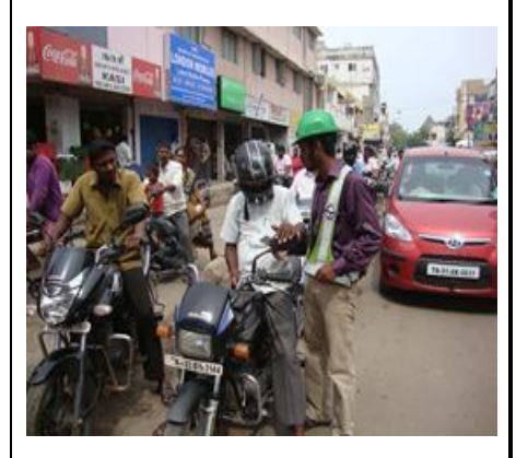
Road Traffic week awareness along with pamphlets' was distributed to road users.