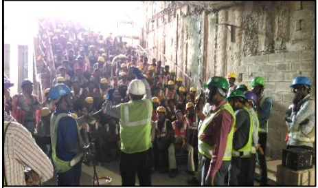
Safety In Oxy-Fuel Operation By Messer (On Site Practical Demo)