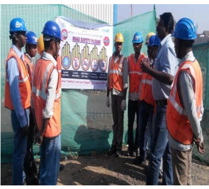
Road safety week celebrated at our site office and project site locations.