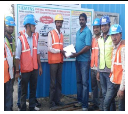
To motivate Workers "safe man of month" award system were implemented at our project.