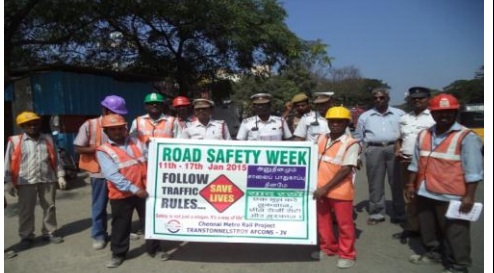
coordination with CTP.

At CMRL-UAA 05 Project, during this quarter various promotional activities were conducted to create awareness among the workers and staff. Also with constant effort through Team work, we have achieved 65<sup>+</sup>% in GC MARS AUDIT for the past 3 quarters. Safety, Health and Environmental aspects are implemented as per CMRL/GC requirements and various internal and external trainings were given to workers and staff from approved agencies.