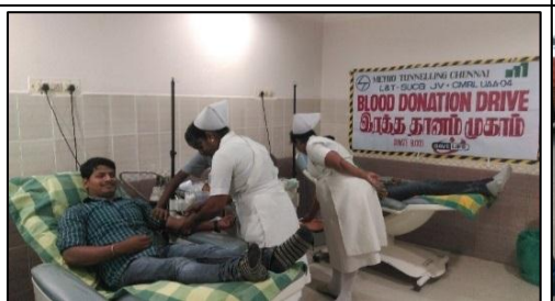
Blood Donation Camp Conducted with the help of KMC Blood Bank (116 Units Collected)