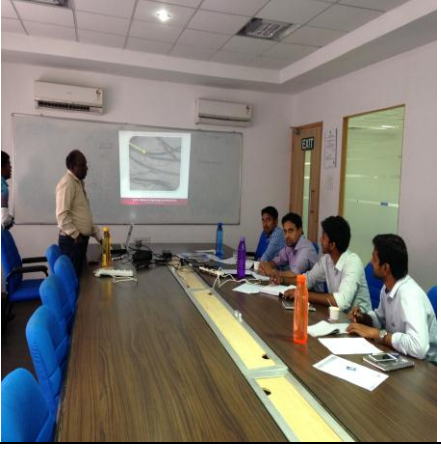
Safe lifting operation training conducted by M/s EHS Solutions