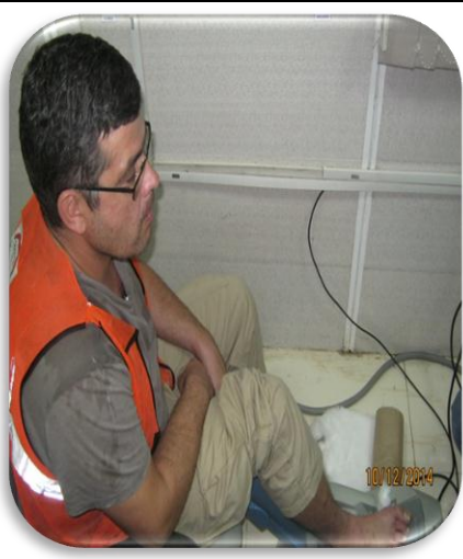
Bone Densitometry Test conducted in TTA – UAA-01.