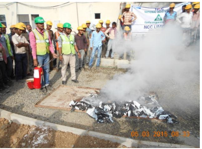
Fire Mock Drill and Fire Fighting Training Given to Workers