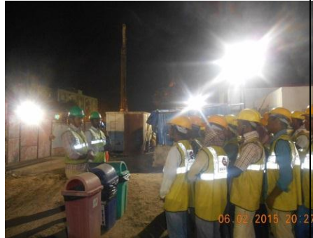
Waste disposal training to workers.