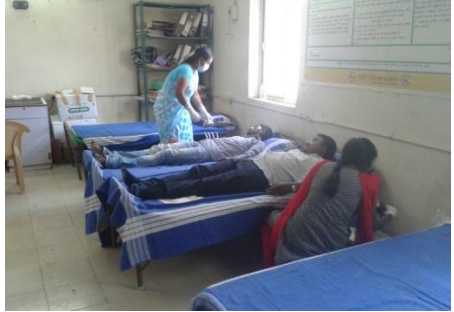
Blood donation camp organized in association with Dr.MGR Medical University.