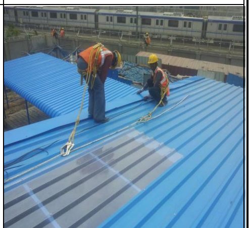
Uses of Life lines and mobile grab fall arrester for roof sheeting work.