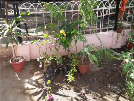
Tree saplings were given to AGDMS office by Gammon India Limited.