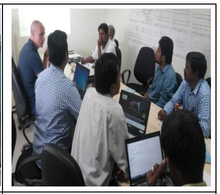
Monthly EHS meeting are conducted and EHS issues are discussed & closed out for safe working environment.