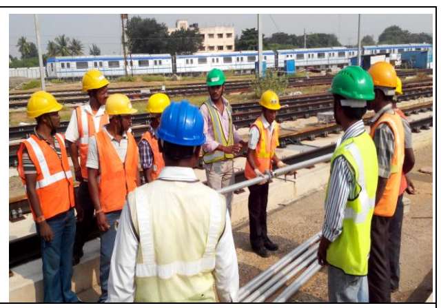
Tool box talk -OHE cantilever erection