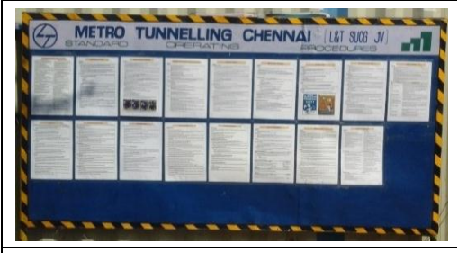
SOP (Standard Operating Procedure) display for current activity at site entrance