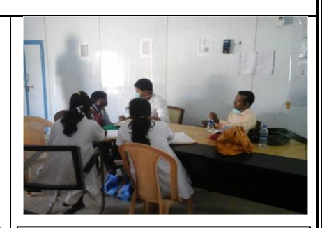
Dental Camp conducted for all staffs and labours on January 2015.