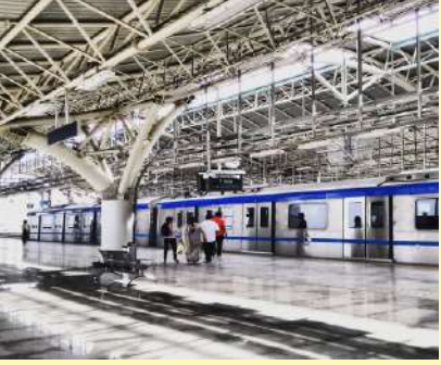
Thiru Abhishek Iyer Location: Alandur