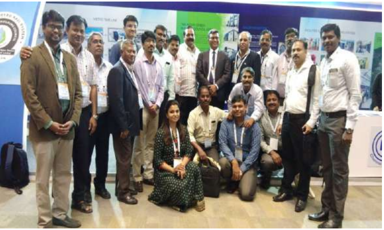
Post your picture